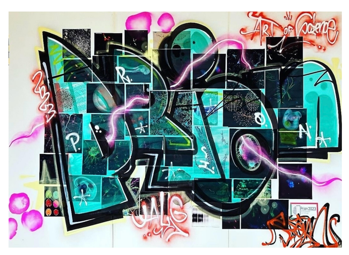
Figure 1. Photograph of the art of science panel. the creativity of a local artist connecting scientific images using graffiti.

One highlight of the meeting was session 10, organized by the 'CJD International Support Alliance', with the involvement of patient organizations from the USA, France, Australia, and Portugal. These organizations play key roles in supporting patients and family members,